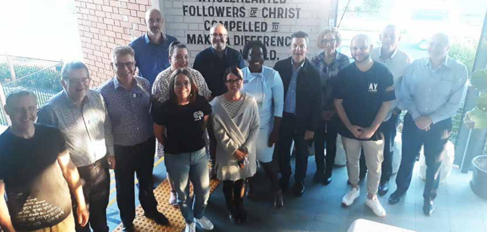
■ Members of our Board with representatives from Arana Hills Church of Christ.