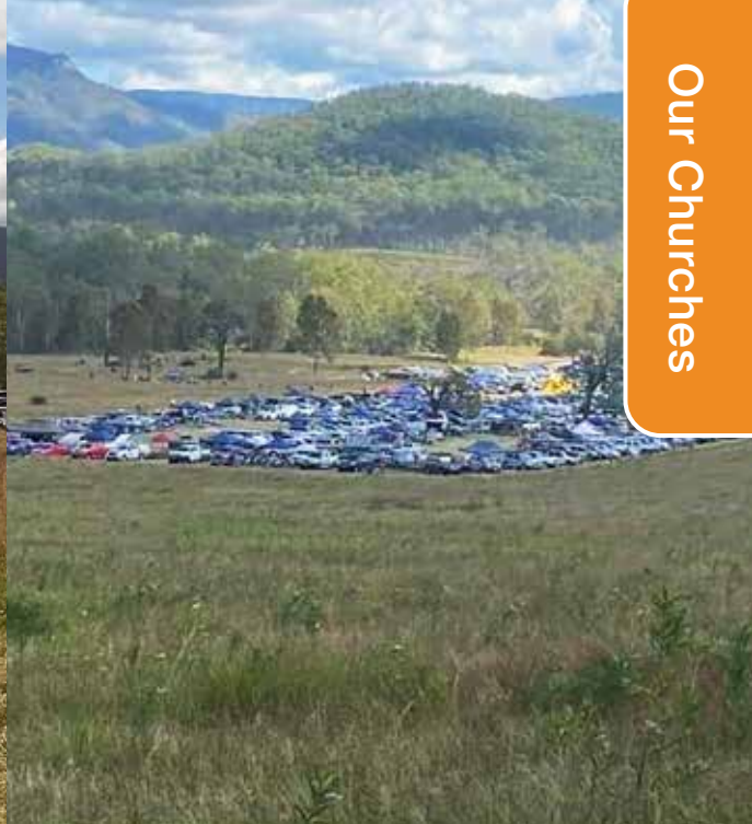
■ The God's Country Trail Ride takes place in the picturesque Scenic Rim.