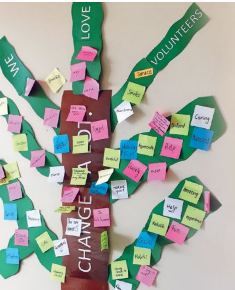
■ Volunteer thank you tree at St James Retirement Village. Residents left messages of love and gratitude to the volunteers.

C hurches of Christ Care St James Retirement Village in Townsville is a hive of activity with volunteers. While the volunteers are drawn to helping others, they are also benefiting from learning new skills and finding job opportunities.