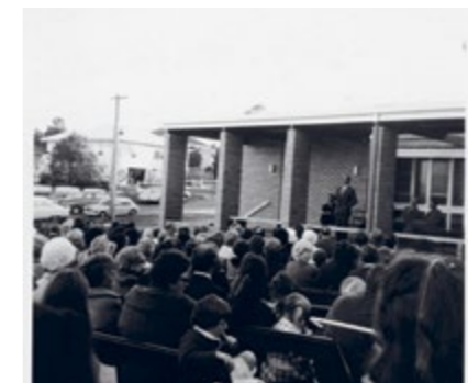
■ Above, Camp Hill Church of Christ Chapel Opening, 1972 and top, Camp Hill Church of Christ Reach Out Campaign, 1978

“You are going to demolish your church?!” the Principal exclaimed.