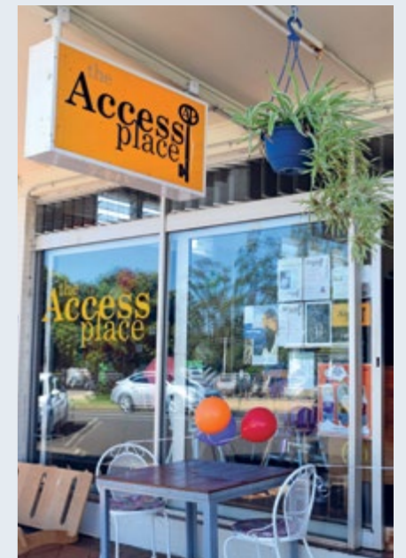
■ The Access Place in Atherton is a home-away-from-home for many in the community.

"The call came just a few minutes before our regular 'coffee & chat', which is a mix of Christian women and connections in the local community. I was able to bring the need to them and one lady from the local Baptist church (who is also one of our volunteers) offered to coordinate a roster within their church family to provide meals for the next two weeks—we coined the phrase 'Love in Action' as the project name. Another lady from the Presbyterian church has