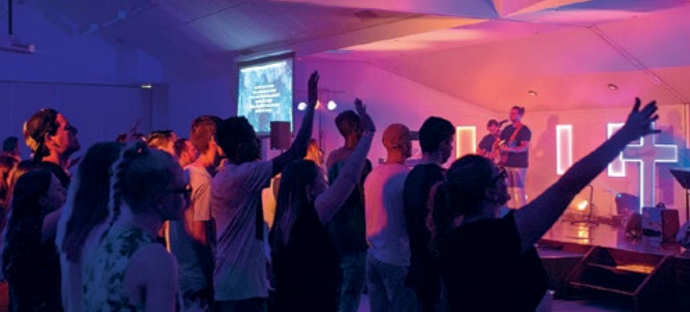
■ Young adults gathered at the L10 conference and found CommUNITY.

Over 13 – 15 April, 145 young adults aged 18-30 from nine Church of Christ churches and five other denomination churches gathered for the annual L10 Conference.