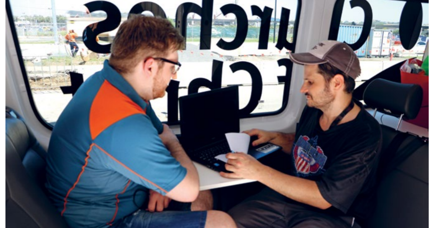
■ Through DigiAsk, volunteers engage with people and empower them to use digital technology.