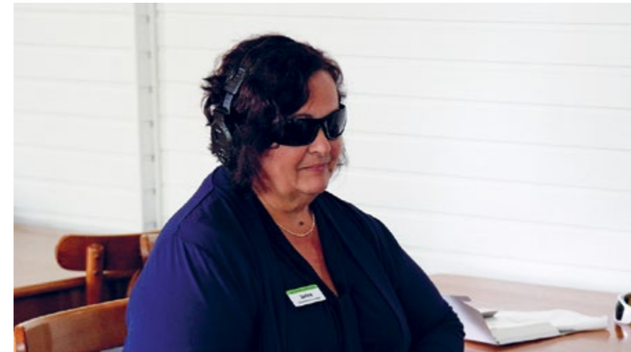
■ A participant is kitted out in patented devices for the Virtual Dementia Tour (R).