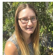
Kellea Bribie Island

To ensure we can pass on all the information needed to your Housing Officer, we will need to know who is calling, your contact details and the reason for your call.