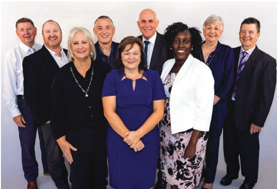
■ The Churches of Christ in Queensland Council.