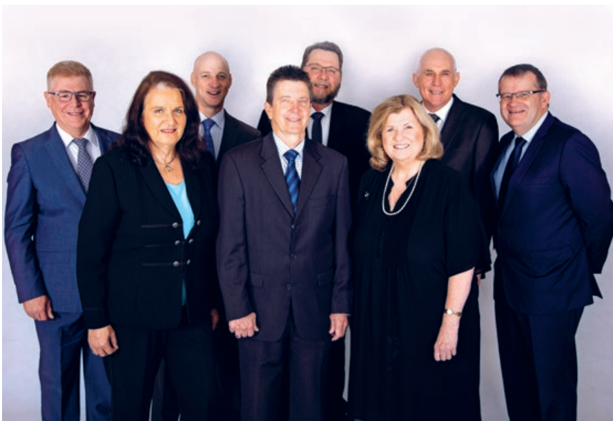
■ The Churches of Christ in Queensland Board.

T he Churches of Christ in Queensland Conference Council and Board bid farewell to another busy year, which was accentuated with finalising our next strategic plan, various Royal Commissions and visits to some of our regional communities.